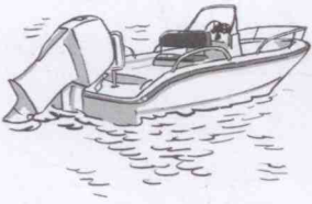
1 a boat